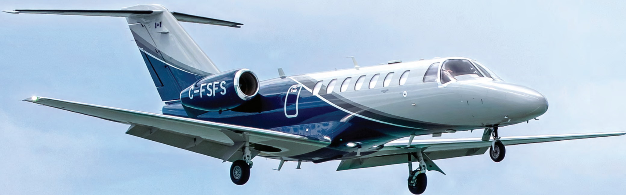
Cessna Citation CJ3+