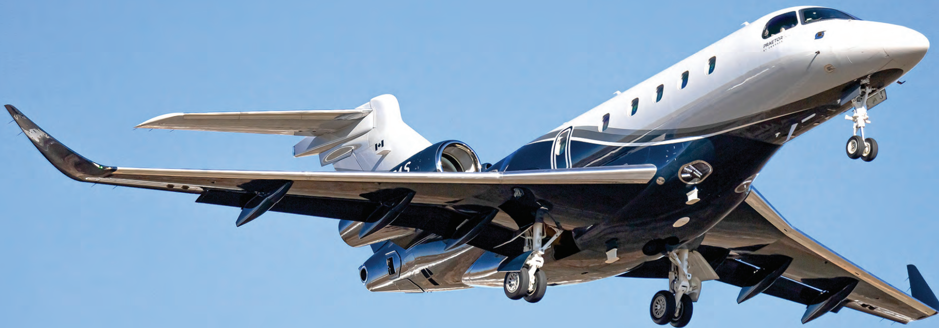
Embraer Praetor 500