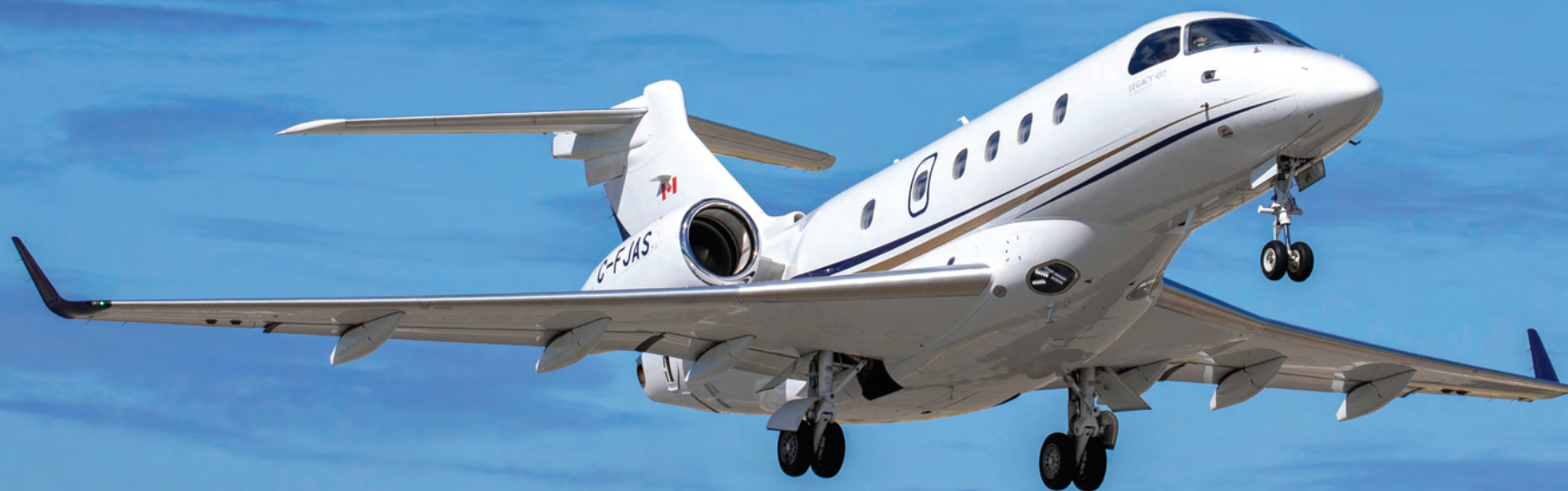
Embraer Legacy 450