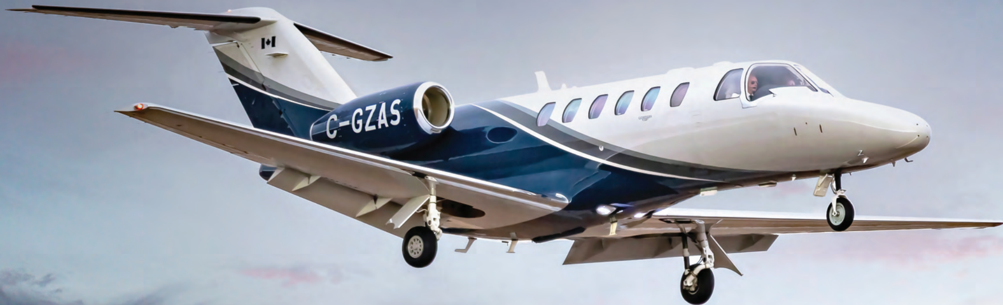
Cessna Citation CJ2+