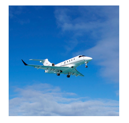
Embraer Praetor 500 | Impressive corner-to-corner aircraft that can quickly and efficiently span North America, learn more - photo credit: Franklyn Wilson.

The only additional fees would result from fuel surcharges, if any. A portion of your Occupied Hourly Rate covers fuel for the aircraft—and is set at a base rate of $1 CDN per litre. If the fuel price exceeds that allocation, you will be billed for the difference—but this only applies to your hours flown. If you don't fly, you won't be billed.