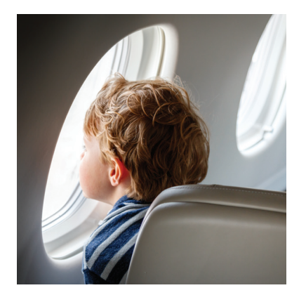
AirSprint's PureSpace | A comprehensive protocol for personal safety and enhanced aircraft cleaning for a greater peace-of-mind, learn more.