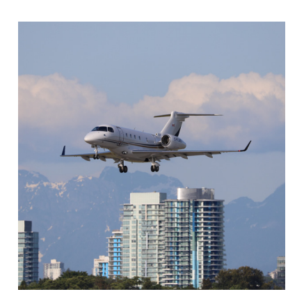
Embraer Legacy 450 | Sets the standard for mid-size aircraft, delivering you an unmatched experience delivering you to your destination, <u>learn more</u>