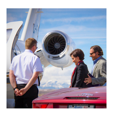
Aviation Is Their Passion AirSprint was the first, and 20 years on, their team continues to deliver a private aviation experience above all others.

Your success has been earned over time. Now, you can live every moment to the fullest in your own personal time machine.