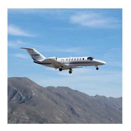
Cessna Citation CJ3+ | Light-jet efficiency and flexibility meet mid-size jet performance, range and comfort, learn more - photo credit: Luis Angel Hernandez.

At AirSprint, we are here to provide information without obligation. We would love to speak with you to determine if your needs align with our solutions. Our private aviation experts are standing by, please <u>contact us</u> today or feel free to call <u>1.877.588.2344</u>.