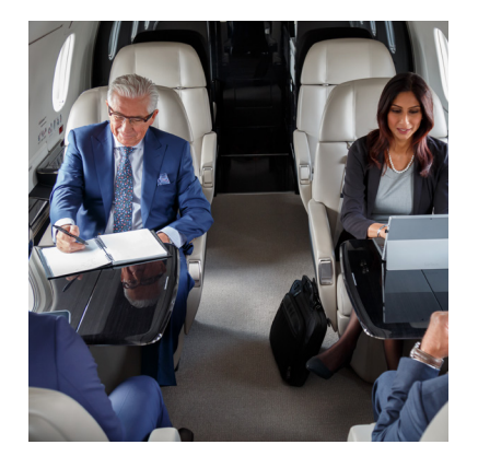
Corporate Private Jet Travel AirSprint is a discreet way to travel, providing the security and sense of privacy that only comes with owning a jet.

About 80 per cent of AirSprint Owners are enrolled in the Capital Purchase ownership option.