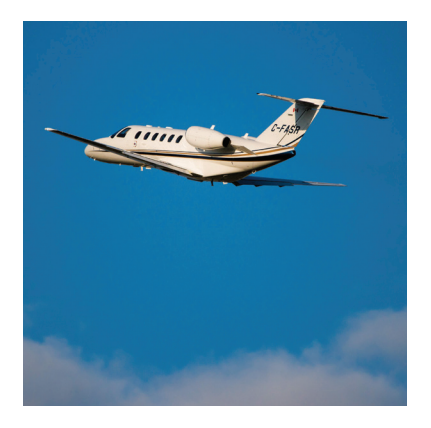
Cessna Citation CJ2+ | High-efficiency paired with classicstyle and comfort - it presents lower operating costs without sacrificing one bit of comfort and reliability, <u>learn</u> <u>more</u>