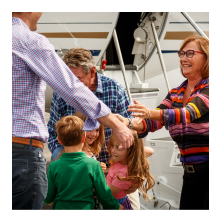
Personal Private Jet Travel | With AirSprint, you'll never miss an important celebration, family weekend or event you've just got to get to.