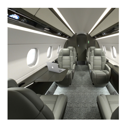
Embraer Praetor 500, AirSprint's Newest Jet Type | With best-in-class speed, best-in-class range, and best-in-class cabin altitude, you will save time—work while you travel or lay back and relax.

"With guaranteed access to North America's newest fleet of fractionally-owned aircraft, AirSprint Owners enjoy the flexibility of their own personal time machine—a smart business tool that drives organizational growth while enabling effective time management."