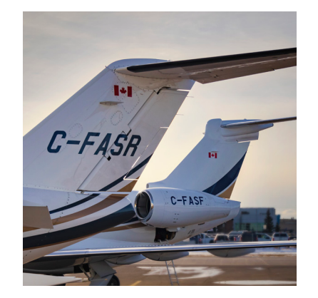
AirSprint's Jet Collection | Eight Embraer Praetor 500s/Legacy 450s, six Cessna Citations CJ2+ and five Cessna Citations CJ3+ (as of August 2021)